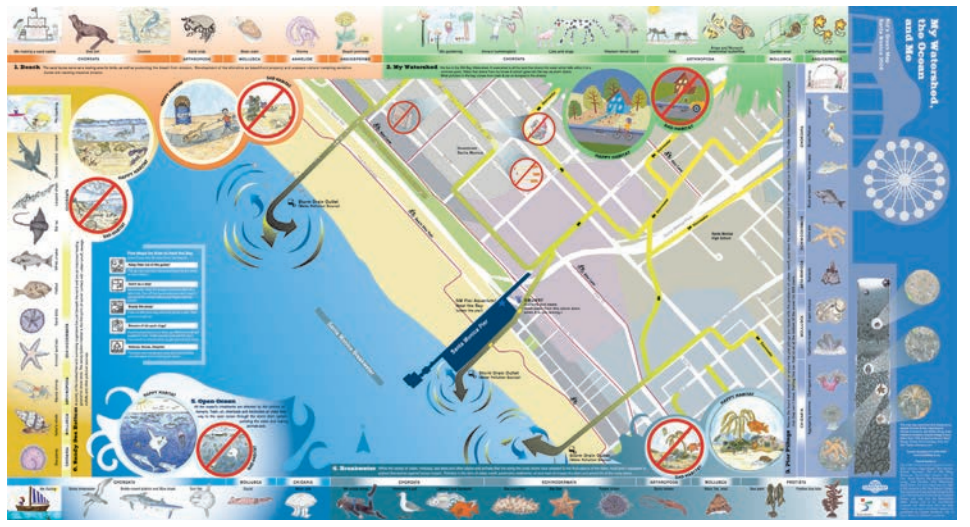
My Watershed, the Ocean and Me – A Kids' Green Map